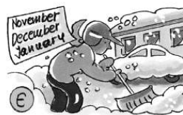
It snows a lot.